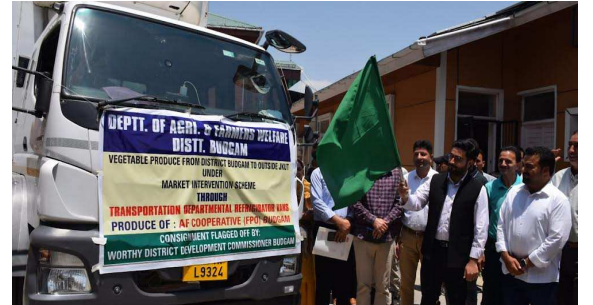
THE KASHMIR TALK BUREAU BUDGAM:

Move aimed to boost supply chain of vegetable movement from Distt Budgam