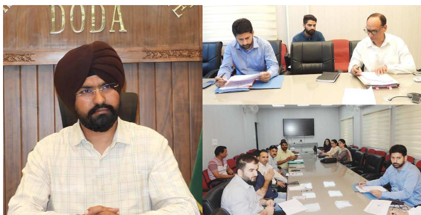
THE KASHMIR TALK BUREAU DODA, MAY 23

DC orders regular inspection, CCTV surveillance for safety of inmates