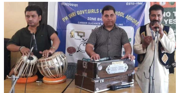
THE KASHMIR TALK BUREAU JAMMU:

The Cultural Unit of the Department of Information & Public Relations (DIPR) Jammu today conducted a Cultural Awareness Programme titled 'Nasha Mukh Bharat' (Say No to Drugs) at Govt. Girls High School Agore, Jammu.