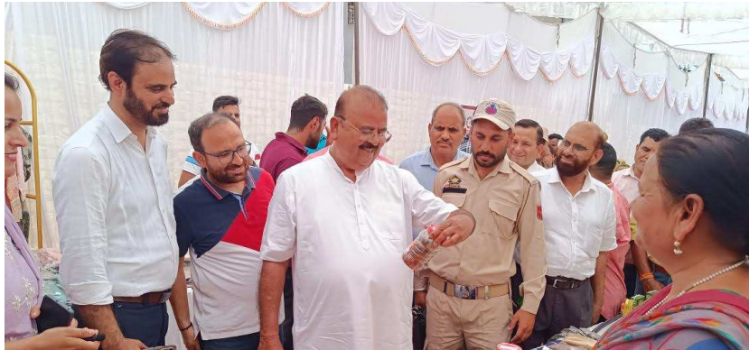
THE KASHMIR TALK BUREAU SAMBA, MAY 23

The Palli Primary Agriculture Co-operative Credit Society Ltd. (PACS) today inaugurated its latest initiative — Co-operative Crumbs Bakery-n-Café — on Bishnah Road, Palli.