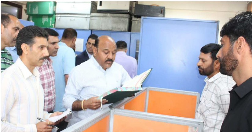
THE KASHMIR TALK BUREAU SRINAGAR, MAY 23

Emphasises prompt disposal of public grievances, punctuality